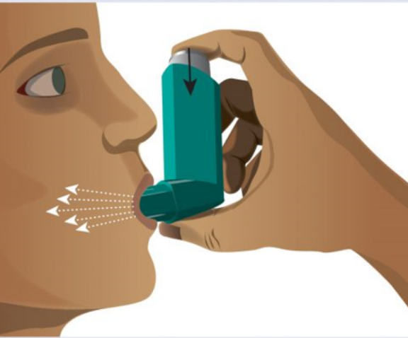
1c. With your lips tightly round the mouthpiece, inhale slowly and deeply for 2-3 seconds while pressing the inhaler canister