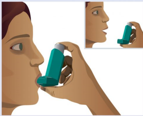
1b. Take a deep breath in then exhale completely and place your lips tightly around the mouthpiece